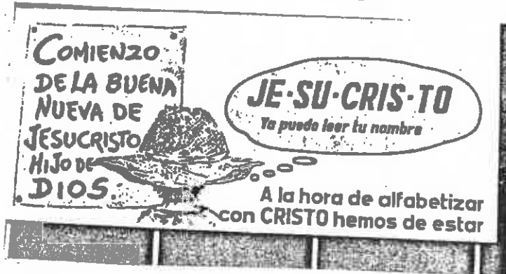
A Billboard in Managua

The beginning of the good news of Jesus Christ, Son of God